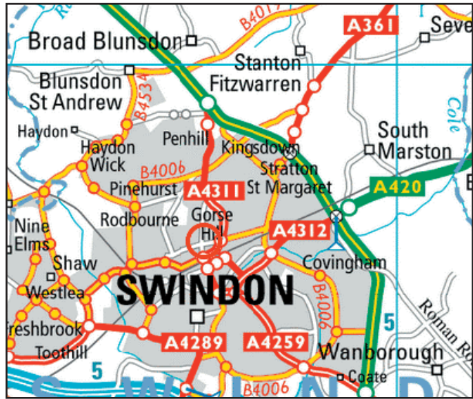
Map 1 (Swindon Surroundings)

Mongoose Publishing 52-54 Cricklade Road Swindon Wiltshire SN2 8AF